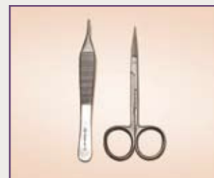
Bandage kit - KIT 001