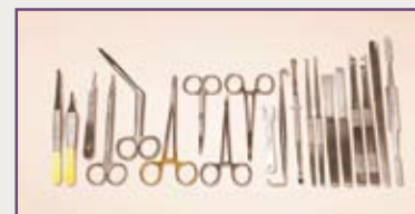
Rhino-septoplasty 2 kit - KIT 012