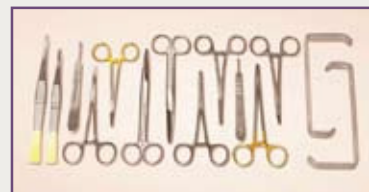
Body kit - KIT 014