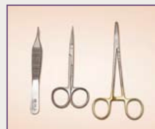
Dermatology kit - KIT 002