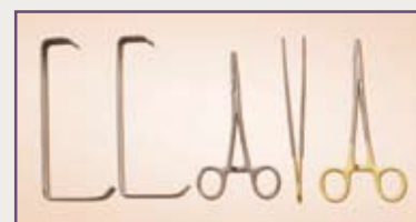
Base CP kit - KIT 016