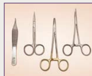
Kit A Plastic Surgery - KIT 003