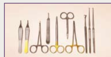
Eyelid kit - KIT 010