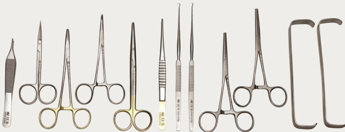
Kit D Plastic surgery - KIT 009